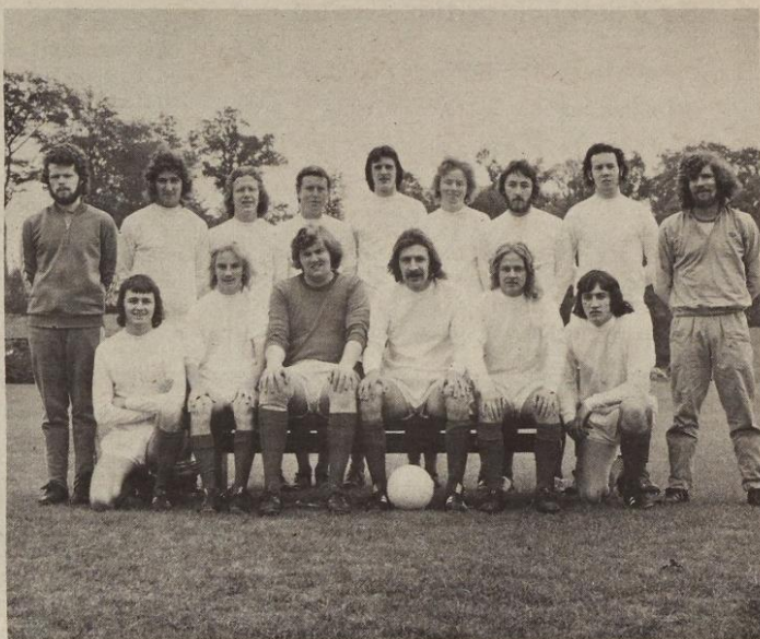
The Stirling team.