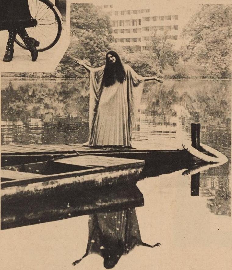
Isadora Angel Dress

Simple pre-Raphaelite line with languorous pleats. Full and flowing in fragrant lilac. A dress to go anywhere in. Be bold. Be noticed.